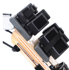
The supports are fully adjustable and are made with polyurethane.