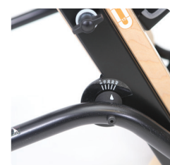
Can be angled from 0° to 40°