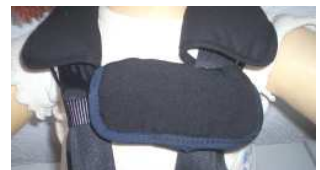
Cross Strap in Padded Sleeve