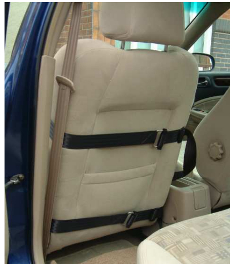
Model 27 Fixing Straps

The waist belt is fitted with the Press Button buckle as standard.