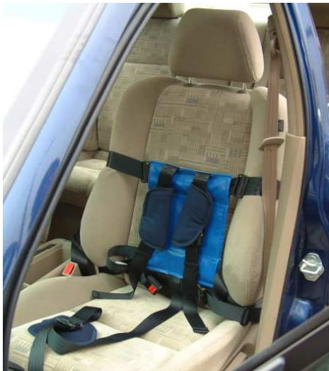
27A - 5yrs to 8yrs

It is not a safety harness & should be worn in conjunction with the vehicle safety belt.